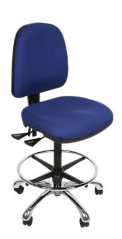
Perry Medium Back Drafting