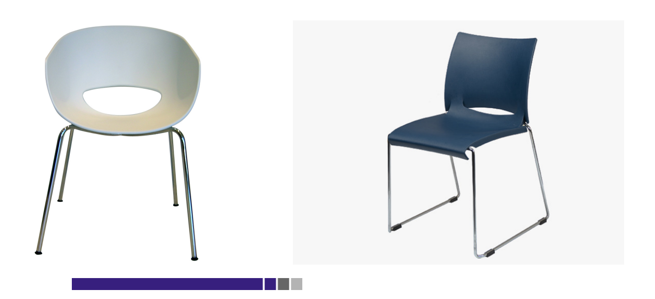
Stylish, chrome frame, plastic shell chair – sturdy, strong and stackable Great for informal settings such as break out areas, hospitality, dining, educational and more Available in Red, White, Blue or Black