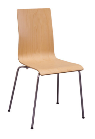
Café 7 Polished beechwood on 4 legs