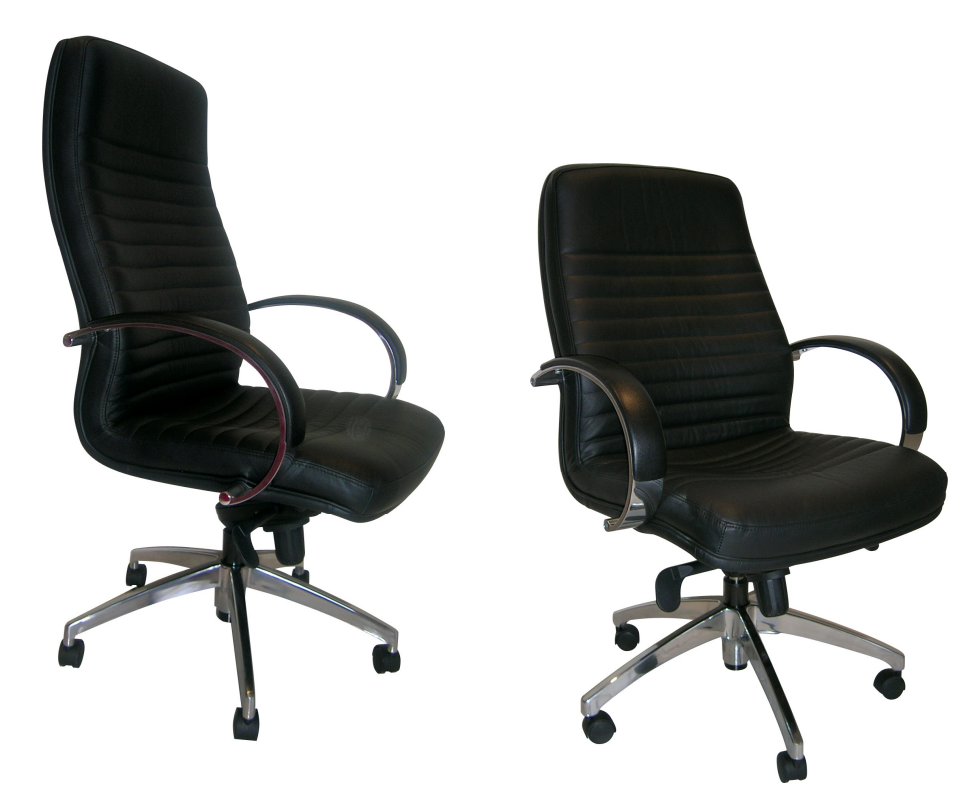
High Back Medium Back